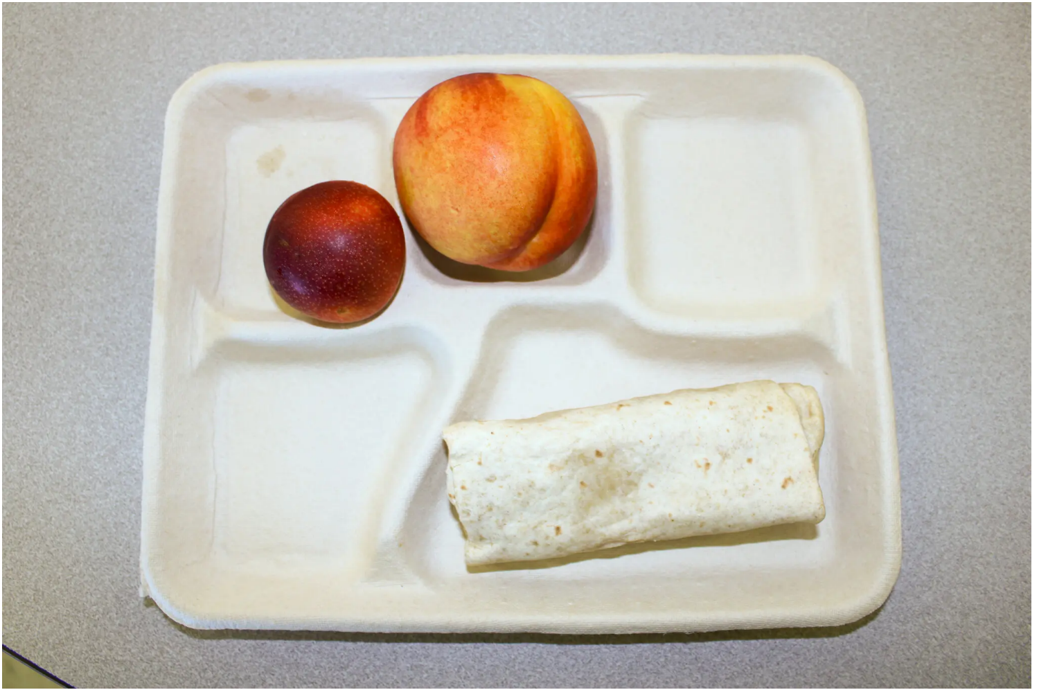
Lunch from the school cafeteria: a chicken burrito and some fruit. The burrito actually tasted pretty good. Michael

“I think what adults misunderstand about what school means to me and my friends is that school is vastly different from when they grew up and went to school. Things that applied to them when they went to school don’t necessarily apply to the current school demographic. Trends and people that were popular when they were kids aren’t popular now.” — Victor, 15